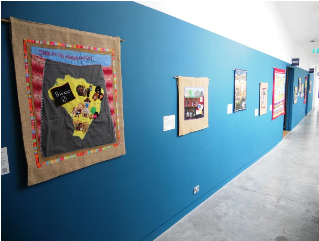
and from the right